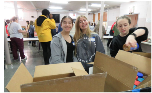
Volunteers opening boxes, checking dates, sorting into crates or boxes.