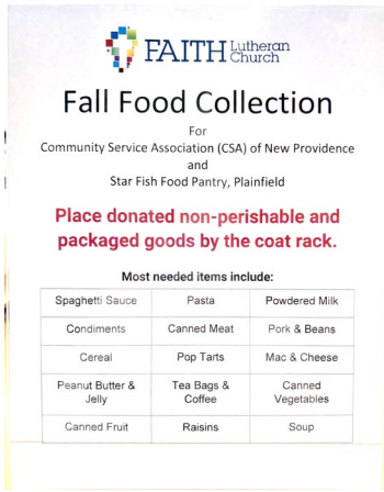
The solicitation poster at Faith Lutheran