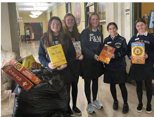
Mt. St. Mary students collected 250 boxes of cereal, an annual project.