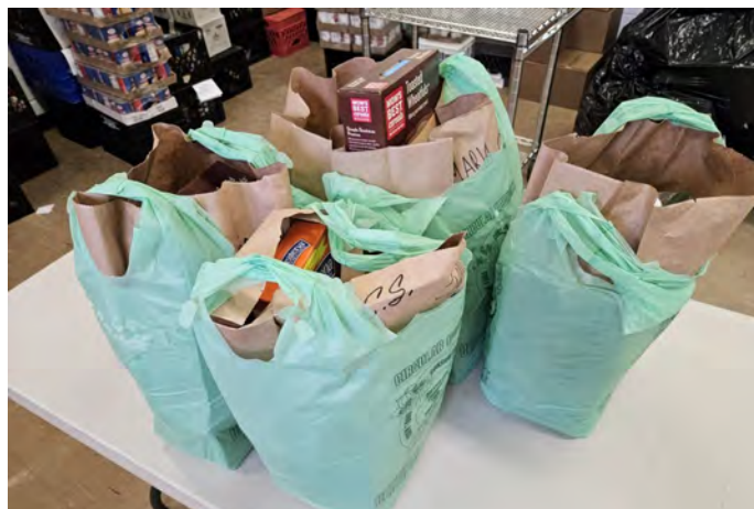
A typical family food order

Too busy to do extra shopping? Donate instead and we'll buy it. Just go to www.starfishplainfield.org and click on the "Donate" button.