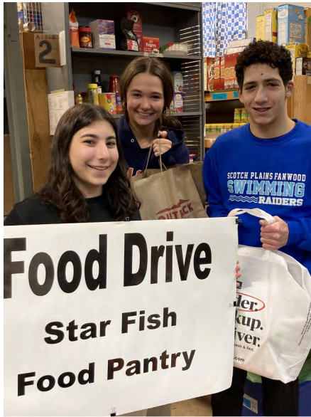
Student volunteers from Fanwood-Scotch Plains High School French Club (left) and Habitat for Humanity Club (right) helped us out this Spring. As did students and parents of Holy Trinity School with their food drive.