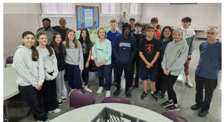
Volunteers who helped accept and sort hundreds of bags of food from the recent Postal Workers collection